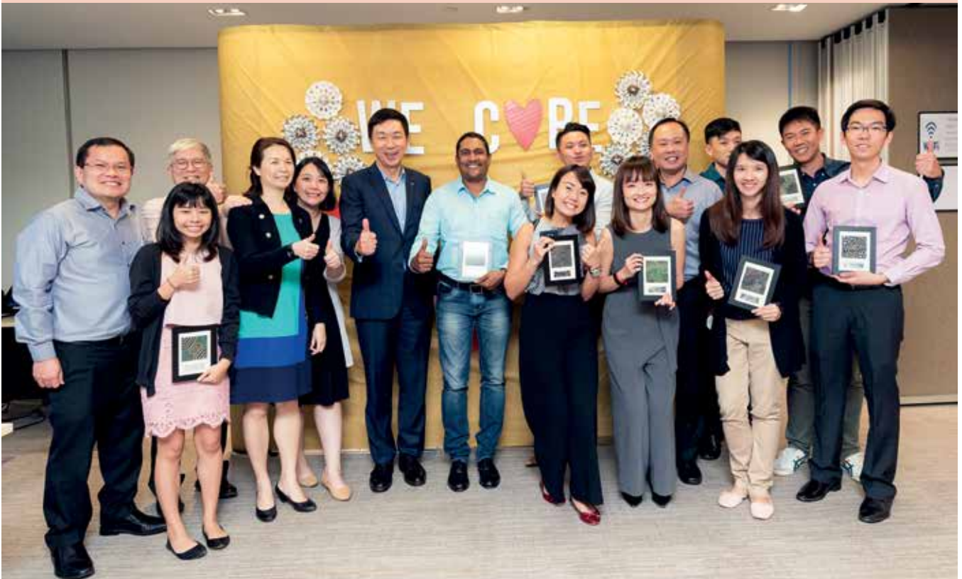
Keppelites being recognised for their dedication and efforts at the annual Keppel Volunteers Appreciation event

In conjunction with International Volunteer Day, Keppel's regular volunteers were recognised for their dedication and community service at the annual Keppel Volunteers Appreciation Dinner held on 5 December 2018 at Keppel Leadership Institute.