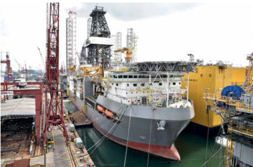
The iDiver has conducted underwater inspections for the CAN-DO drillship, which is scheduled for completion in 2019