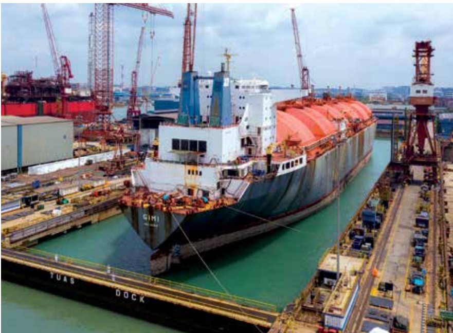
Keppel Shipyard has received limited notice to proceed to commence early conversion works for FLNG vessel Gimi

Keppel Shipyard has received a limited notice to proceed from Golar Gimi Corporation, a subsidiary of Golar LNG Limited, to commence early conversion works for the floating liquefaction vessel Gimi. The project will take place over a period of up to four months, worth up to $50 million.