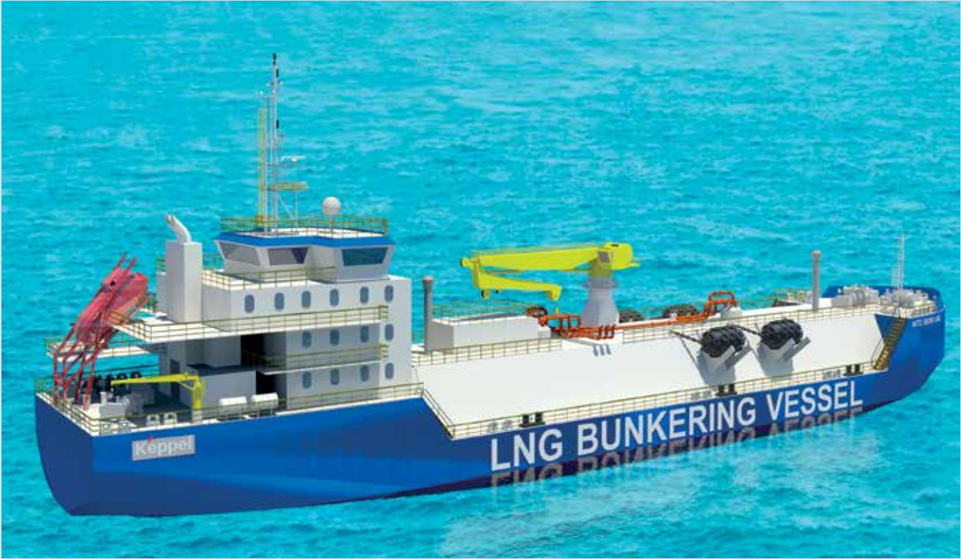
To be built to a proprietary design of Keppel O&M's ship design and development arm, Marine Technology Development, the ice-class LNG bunker vessel will have an Ice Class Arc 4 notation and a cargo capacity of 5800 cubic metres

Keppel Offshore & Marine (Keppel O&M) ended 2018 on a high note with the securing of marine contracts worth about $300 million for vessel new build and upgrading projects.