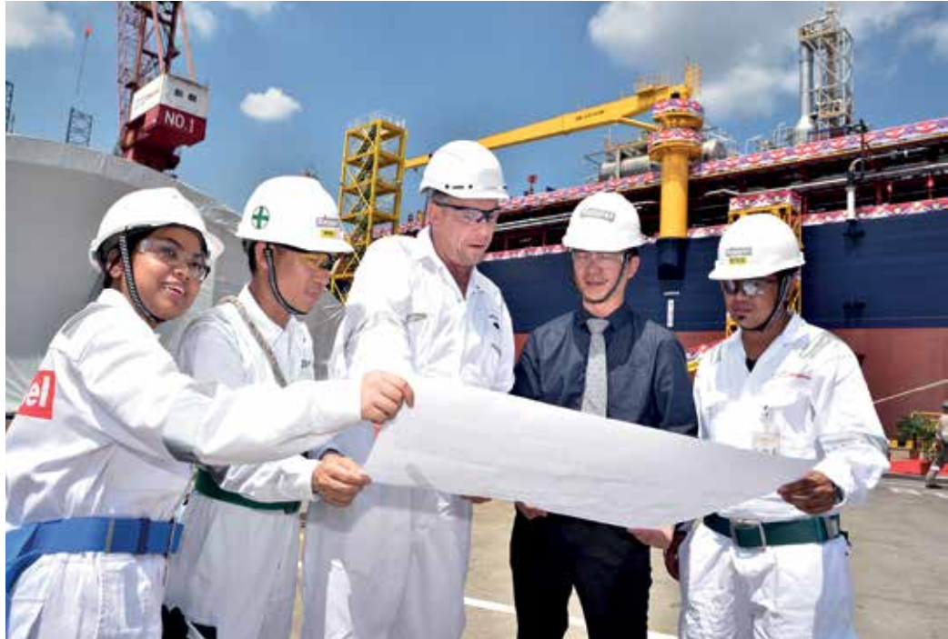
Keppel O&M works closely with customers to deliver solutions and ensure excellent project execution

The Group remains committed to putting in place effective and robust compliance and governance regimes and discharging the undertakings given as part of the 2017 global resolution Keppel O&M had reached with the relevant criminal authorities. The enhancements to the compliance processes and procedures included increasing the resources of the Group's internal audit function and conducting