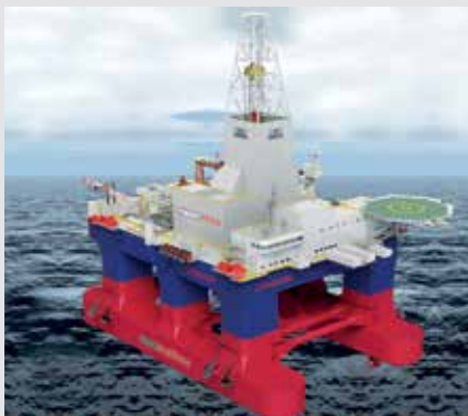
Keppel O&M has a strong track record of having delivered 25 semis since 2000

Keppel O&M signed a Technical Assistance and License Agreement (TALA) with Gaztransport & Technigaz (GTT) that will enable Keppel O&M's network of global yards to offer GTT's LNG systems in the design, construction and maintenance of LNG carriers, LNG