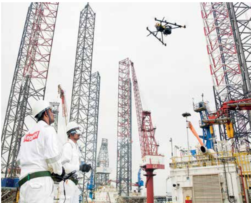
Keppel O&M is leveraging technology such as specialised drones to improve operations, processes, safety and efficiency