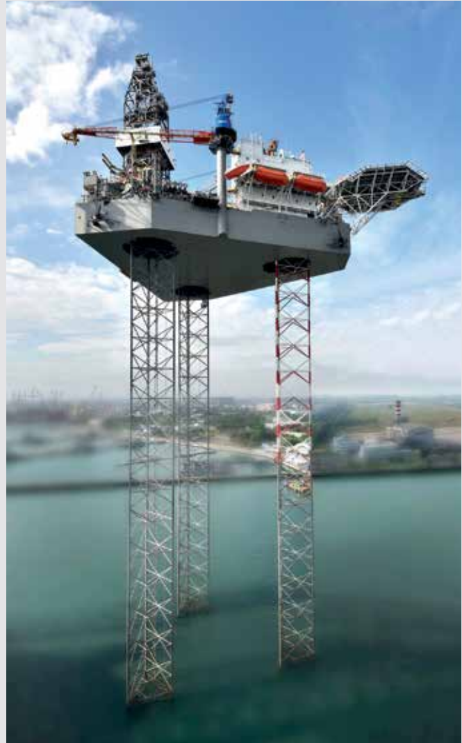
SAGA is a KFELS Super B Class rig designed to operate in 400 feet water depth and drill to 35,000 feet

Keppel Singmarine secured a contract from FuelNG, a joint venture between Keppel O&M and Shell Eastern Petroleum (Pte) Ltd, to build South East Asia's first Liquefied Natural Gas (LNG) bunkering vessel.