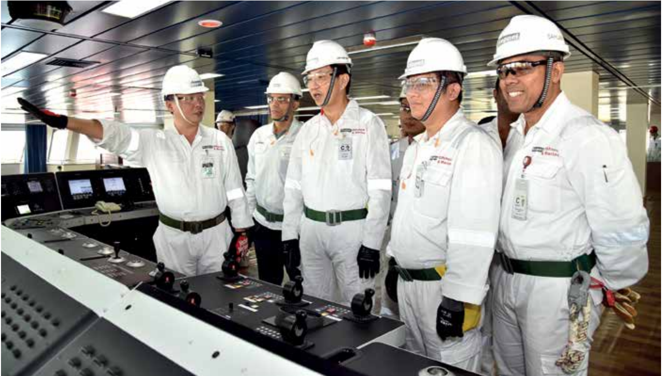
Onboard the CAN-DO drillship for a safety walkthrough are the senior management of Keppel O&M