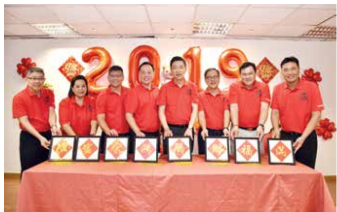
Keppel O&M board, management and union shared well-wishes with employees