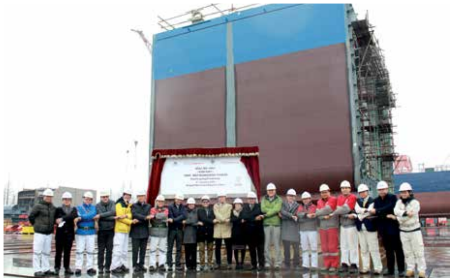
Scheduled for delivery in 2H 2019, Singapore's first dual-fuel bunker tanker will deliver marine fuels to ocean-going vessels within local port limits