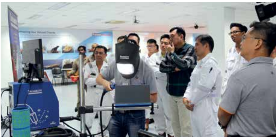
Keppel Shipyard management viewing a demonstration of the augmented reality welding training simulator

At the finale held on 7 November 2018 at the Keppel Leadership Institute, five teams from Singapore, China, Brazil and Qatar, including team 'Keppel Consulting' from BrasFELS, competed to present groundbreaking new ideas. Eventually, team 'The Boring Print' from Keppel Technology & Innovation emerged as winners of the Symposium with their tunneling solution which performs 3D printing of the underground pipes while tunneling.