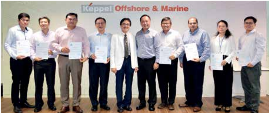
Keppel O&M has achieved the ISO37001 certification

Keppel continued to strengthen its regulatory compliance measures in the last quarter.