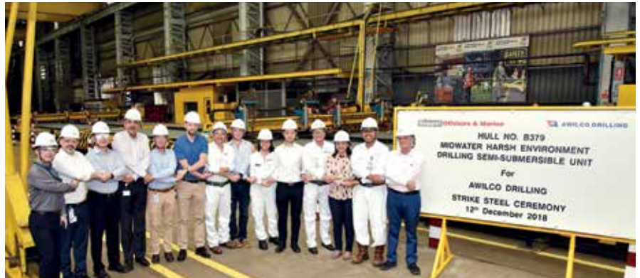
The mid-water harsh environment semi to be built for Awilco will extend Keppel's strong track record of delivering 25 semis since 2000

In the same month, Keppel Singmarine held the strike steel ceremony for South East Asia's first LNG bunkering vessel to be built for FuelNG, a joint venture between Keppel O&M and Shell Eastern Petroleum (Pte) Ltd. The 7,500m 3 dual-fuel LNG bunkering vessel will be built to the MTD 7500U LNG design, a proprietary design of Keppel O&M's ship design and development arm, Marine Technology Development (MTD).