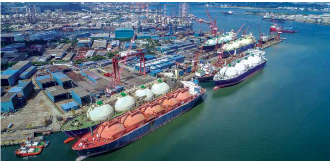
Keppel O&M secured new contracts totalling $1.7 billion in 2018, more than $600 million of which are from LNG and scrubber projects