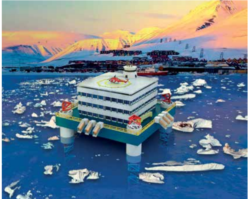
Keppel NUS Corporate Lab is looking into the possibility of developing a multipurpose SAR Hub

Keppel Offshore & Marine (Keppel O&M) was invited by the Norwegian Ministry of Foreign Affairs to participate as part of the Singapore delegation in the Arctic Frontiers conference in Tromso, Norway.