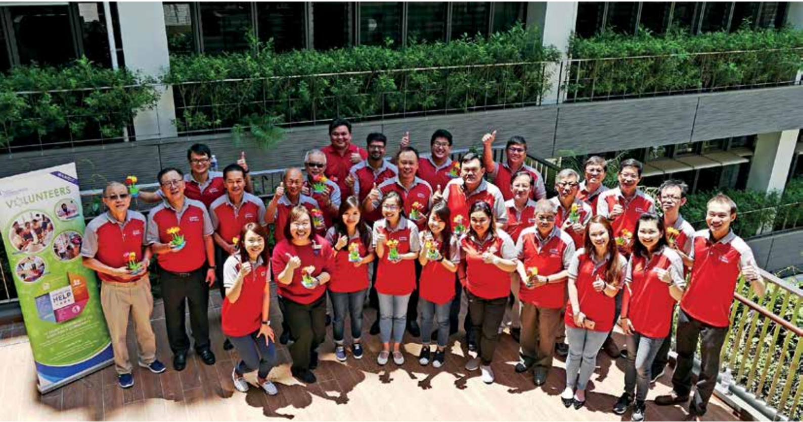
Volunteers from Keppel O&M Alumni and Keppel O&M organised games for elderly patients and presented them with hand-made gifts