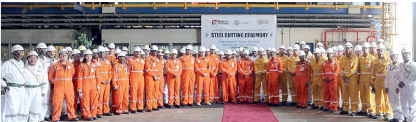
Rosetti Marino and N-KOM teams celebrated the strike steel for an offshore accommodation platform project

N-KOM is undertaking the fabrication of the first offshore living quarters in Qatar. The shipyard together with its customer Rosetti Marino had a strike steel ceremony for the project on 9 January 2019.