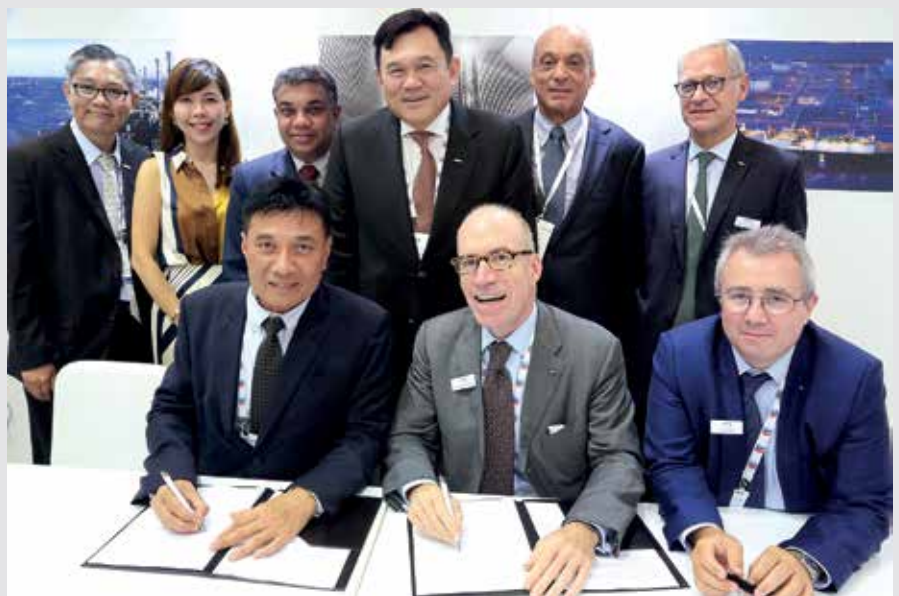
The partnership with GTT will allow Keppel O&M to offer more comprehensive LNG solutions to its customers, across its global networks of operations