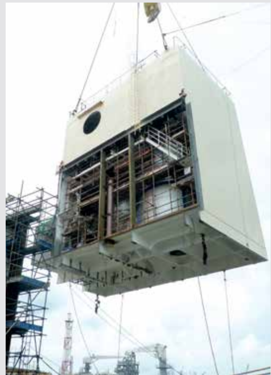
Keppel Shipyard secured exhaust gas scrubber retrofit projects from a variety of customers