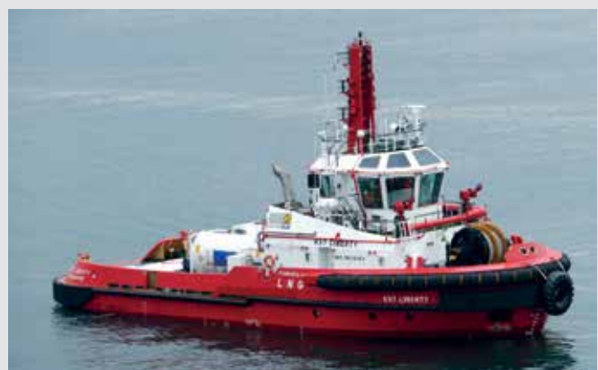
Keppel's proprietary design a dual fuel LNG tug won the Outstanding Maritime R&D and Technology Award at the 2015 Singapore International Maritime Awards