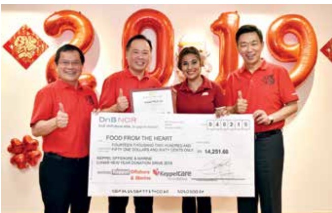
A donation was made by Keppel O&M to the Food from the Heart charity

The Lunar New Year celebrations were organised by the Keppel FELS Production department and included performances and games as well as a "Lo Hei" by Keppel O&M's management, employees, customers, partners and contractors.