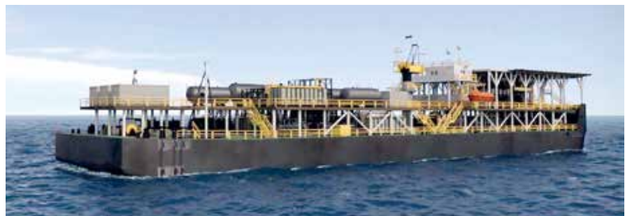
Keppel Shipyard will undertake modification and upgrading of a production barge for SJ Production Barge, a subsidiary of KrisEnergy

Keppel Shipyard's scope of work on the production barge for KrisEnergy includes installation of a power generation module, Electrical House, new accommodation units and other refurbishment works.