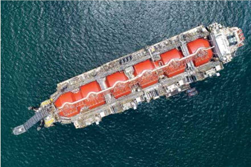
The FLNG Hilli Episeyo has been a successful proof of concept as a quick and cost-efficient solution for monetising stranded gas reserves. It has maintained 100% uptime since commencing commercial operations in June 2018 and consistently despatched two LNG cargoes each month