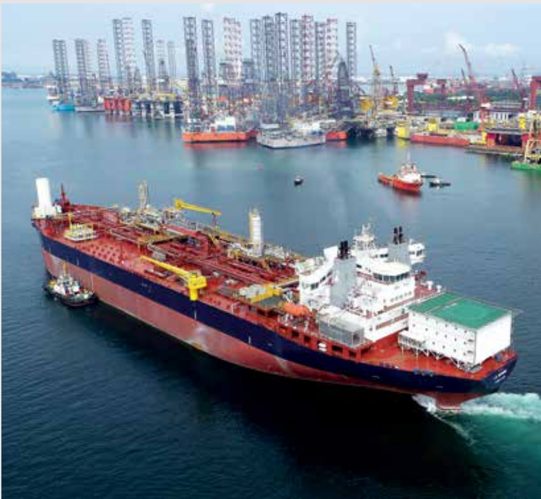
The conversion of the FPSO La Noumbi was the sixth project Keppel Shipyard has delivered to Perenco

Keppel Shipyard secured a total of 65 contracts from a variety of customers for exhaust gas scrubber retrofit projects involving project management, integration design engineering, installation and retrofitting, as well as testing and commissioning works.